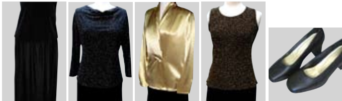
BLACK VELVET SKIRT DK BLUE GLITTER TOP GOLD BLOUSE GOLD GLITTER TOP LADY'S SHOES

Cruiseline Formalwear has designed an elegant line of evening wear that is perfect for all the formal activities on your cruise. The styles have been selected to complement each other. Rental garments are available. For more information please visit our web site.