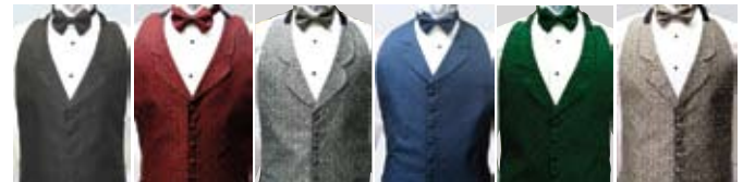
BLACK BURGUNDY SILVER BLUE EMERALD GOLD